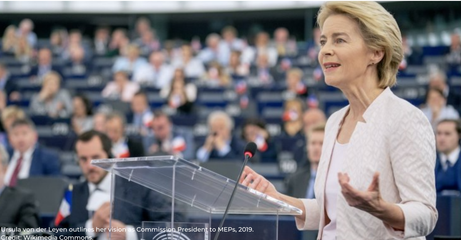
Ursula von der Leyen outlines her vision as Commission President to MEPs, 2019.

See all our stories at thenewfederalist.eu .